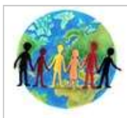
Hand in Hand Global e.V, Germany