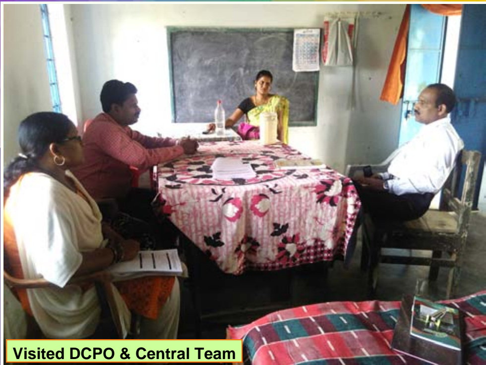
Visited DCPO & Central Team